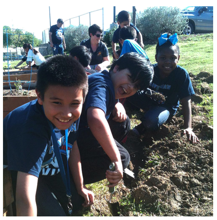
Local youth help plant garden in Texas.