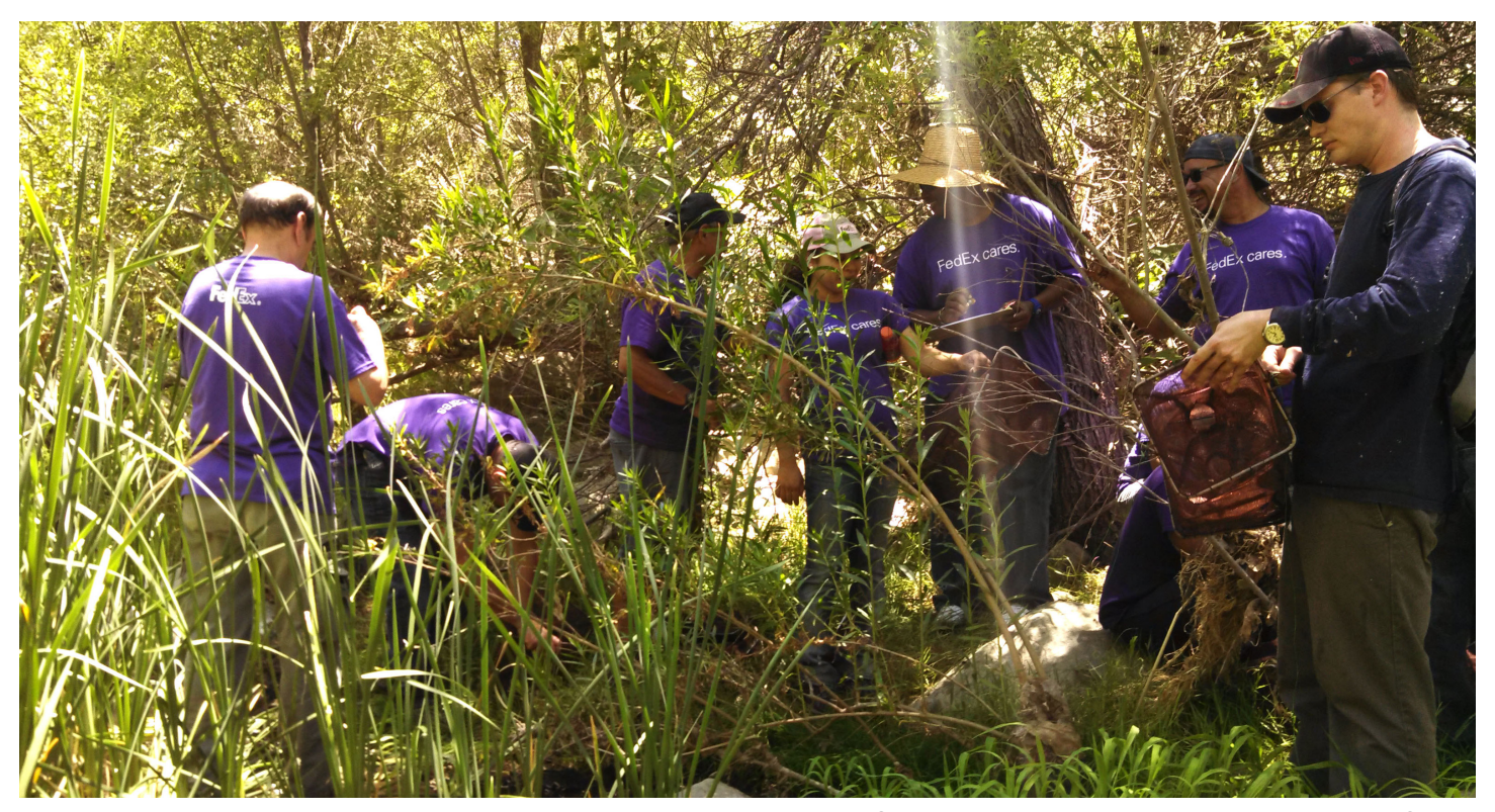
FedEx volunteers partake in a crayfish removal program in Los Angeles County, California.