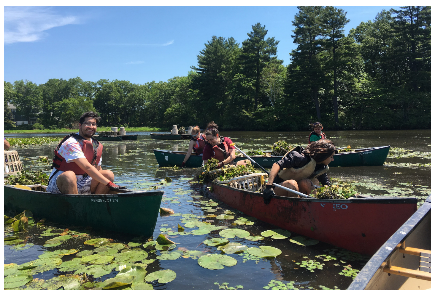
Volunteers remove invasive water chestnut on the Charles River in Boston, Massachusetts.

watershed. The grantee and project partners will engage 1,500 local South Baltimore residents, with a specific focus on the Latino population, in urban watershed education and conservation activities at the Masonville Cove Environmental Education Center. Project partners include Living Classrooms Foundation, the National Aquarium, Maryland Port Administration, Ben Franklin High School, Templo de Alabanza y Restauracion Church of God and others.