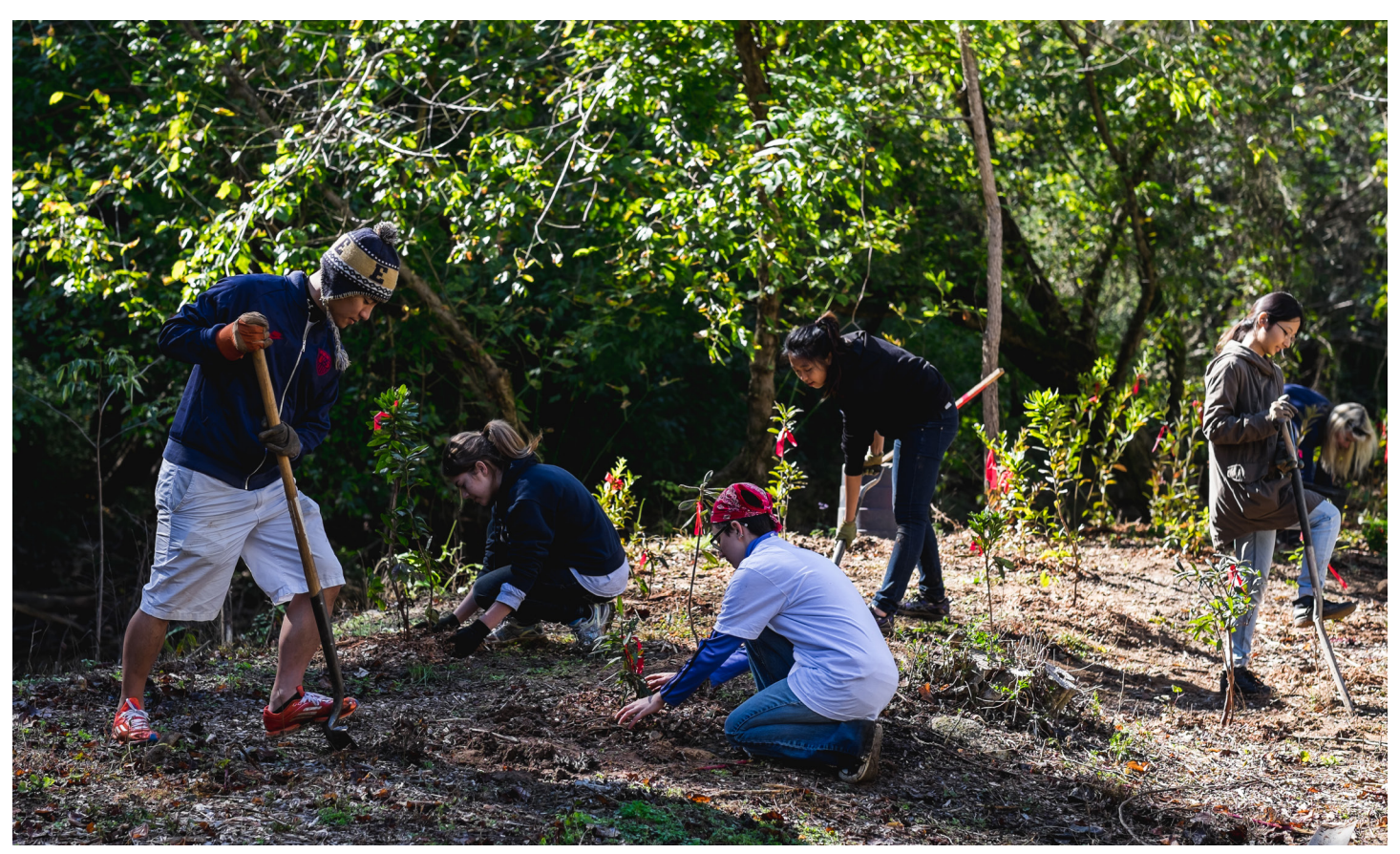
Trees Atlanta and community members plant saplings along South Fork Peachtree Creek in Decatur, Georgia.