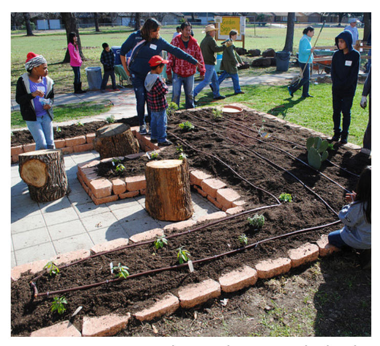
Volunteers observe new school garden at a local elementary school in Dallas, Texas.

REAL School Gardens will install three learning gardens at high-poverty elementary schools in the Dallas-Fort Worth area, which spans the Blackland Prairie and Cross Timbers and Prairies ecoregions. The grantee and project partners will will raise environmental awareness, restore native habitats for species like the monarch, anise swallowtail and gulf fritillary butterflies and conserve stormwater by bringing conservation education to nontraditional audiences, including high-poverty and minority communities. Project partners include high-poverty elementary school communities, school districts, and corporate partners like Redenta's and the United Way of Metropolitan Dallas.