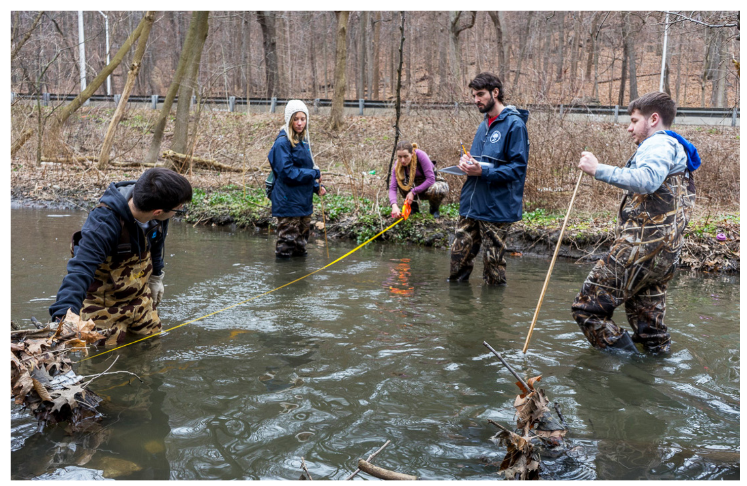
Friends of Van Cortlandt Park engage the Bronx community through water level monitoring at Tibbett's Brook, New York.

as Japanese knotweed and restore native habitat through planting native trees such as American sycamore, sugar maple and sweet gum, as well as native shrubs such as button bush, silky dogwood, pussy willow and others in 1.4 acres of the Bronx Forest. The grantee and project partners will engage students in learning about trees and the forest ecosystem in the classroom and in the field in addition to empowering community volunteers to take an active role in restoring the Bronx Forest native ecology. Project partners include New York City Parks, the New York Botanical Garden, Bronx Community Charter School, Bronx House and Bronx River Alliance.